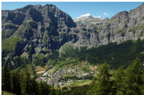
view of Leukerbad